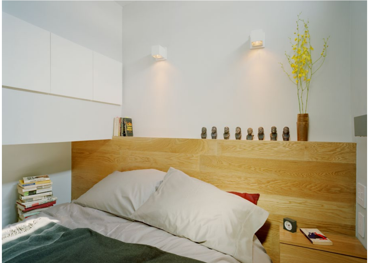
Building the bed platform as part of the loft structure allowed for a full-height walk-in closet below.