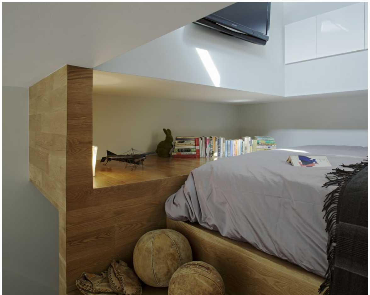
A roller shade lowers to separate the sleeping loft from the living space.